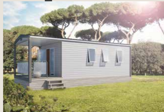
Model shown with the metal and fabric guard rail option