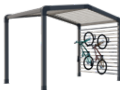
Bike rack and/or storage