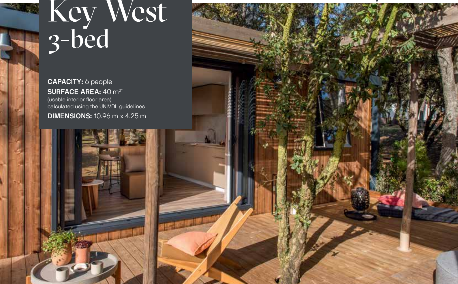
Shown in Bronze wooden cladding