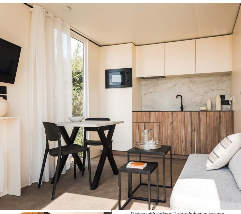
Kitchen with optional 2-rings induction hob and integrated microwave

90 cm wide vanity unit with built-in storage and towel rails