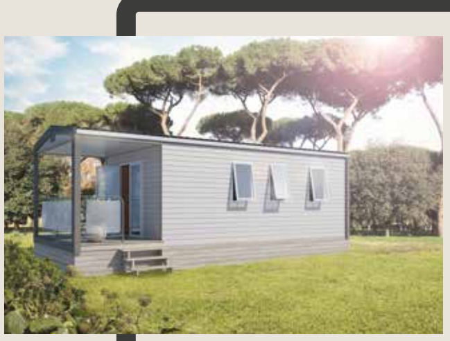
Model shown with the metal and fabric quard rail option