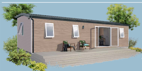
The Aqua 3 is shown with Muscade cladding on the front elevation.

We all see comfort differently, as all large families know! With 2 bathrooms, 3 bedrooms including a master suite, and a living room offering 4 distinct spaces: kitchen, living room, lounge and cloakroom, everything is designed to make everyone feel at home.