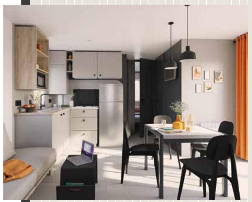
Model shown with silver fridge/freezer option

An entrance hall, relaxation area or storage space, modul'homes are perfectly suited to mobile homes with 1- and 2-slope roofs. They can be placed at the gable end, as an entrance, or separately from the mobile home.