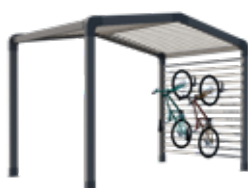
Bike rack and/or storage