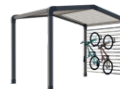
Bike rack and/or storage

An entrance hall, relaxation area or storage space, modul' homes are perfectly suited to mobile homes with 1- and 2-slope roofs. They can be placed at the gable end or separately from the mobile home.