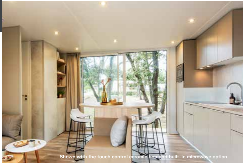
Shown with the touch control ceramic hob and built-in microwave option

Large semi-open cupboard in the entrance Central island with built-in socket and 6 high stools White resin sink with drainer Top-of-the-range, ACS-certified mixer taps Stainless steel finish gas hob with 4 burners Built-in extractor hood 179L built-in fridge-freezer TV mount Small bookshelf fitted with socket and lit by a wall light Almond-coloured woven cloth sofa in the alcove 1 Mocha polyvinyl armchair with Almond cushion Two matching coffee tables 1000W smart convector heater