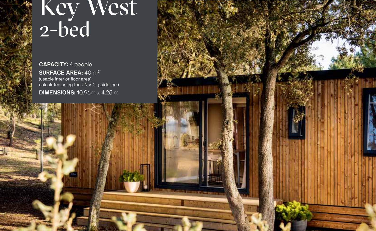
Shown in Bronze wooden cladding

CAPACITY: 4 people SURFACE AREA: 40 m 2 (usable interior floor area) calculated using the UNIVDL guidelines DIMENSIONS: 10.96m x 4.25m