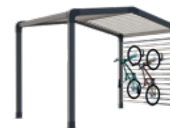
Bike rack and/or storage

An entrance hall, relaxation area or storage space, modul'homes are perfectly suited to mobile homes with 1- and 2-slope roofs. They can be placed at the gable end, as an entrance, or separately from the mobile home.