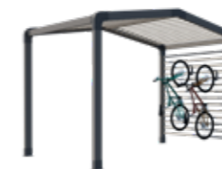
Bike rack and/or storage

An entrance hall, relaxation area or storage space, modul' homes are perfectly suited to mobile homes with 1- and 2-slope roofs. They can be placed at the gable end, as an entrance, or separately from the mobile home.